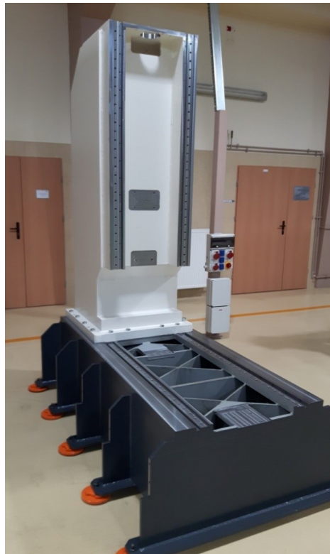
Fig. 5. The CNC milling machine frame after seasoning, vibrating and machining

Using stress relieving vibration results in an advantageous reduction of peak stresses in the welds that are decisive to their fatigue strength – Fig. 5.