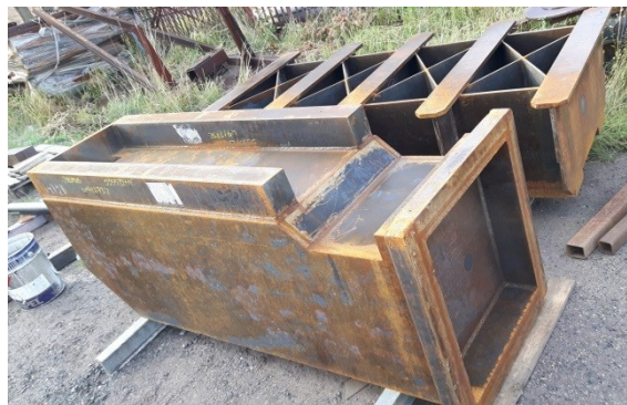
Fig. 4. Machine tool pillars and bases during seasoning

The frame was constructed of enhanced-strength steel S355J2. It was made by the MAG method employing the following welding parameters: current intensity – welding currents, 280 - 290 A; voltage, 26V; 1.2 mm-diameter wire in grade G4Si1. V and X-type grooves were designed for making welds, depending on the access to them. In the future, for similar solutions, robotized welding with off-line programming assisting can be used [18]. If further design and technological changes are made, it will be possible to reduce the mass by employing other welded materials [19] and more accurate weld dimensioning [20]. The analysis of the above-mentioned activities and the industrial implementation of the frame under discussion may lead to further engineering & design changes, similarly as for the nodes described in work [21].